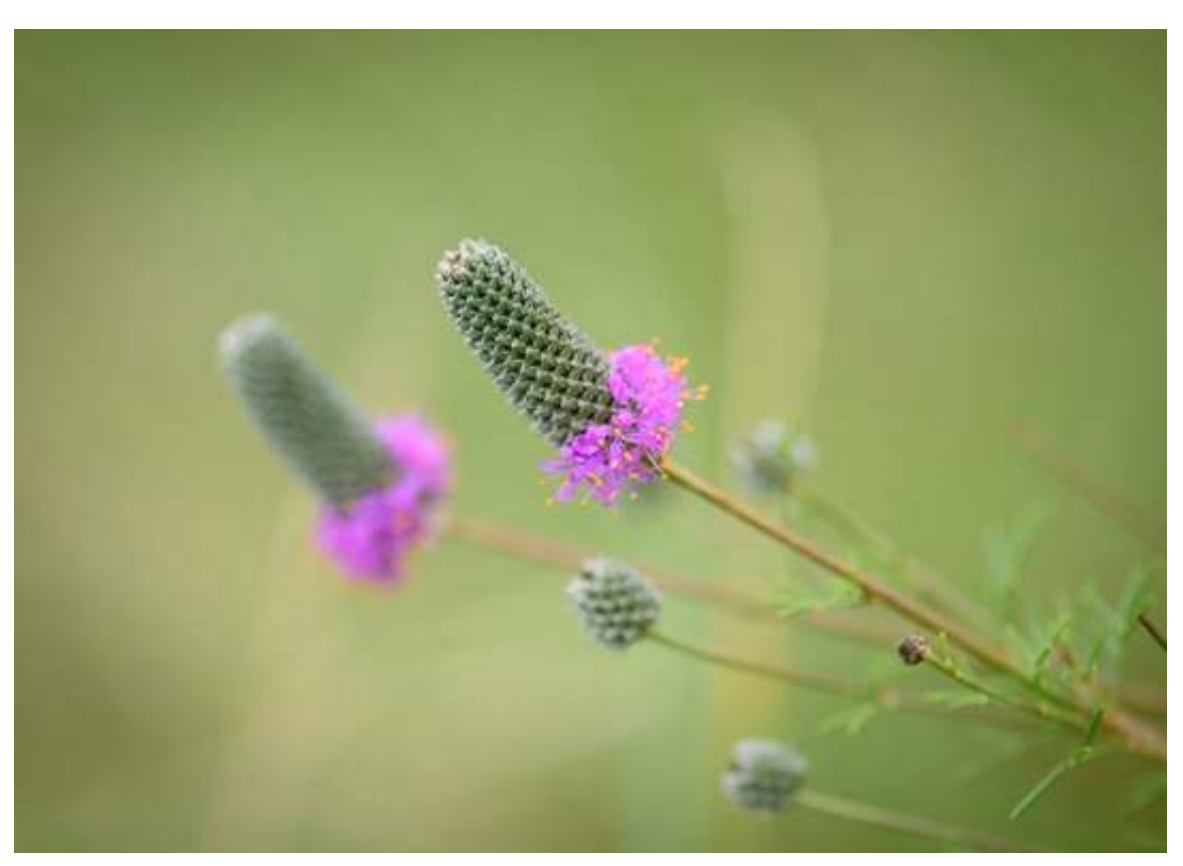
Purple Prairie Clover, (Dalea purpurea)

Hundreds of private properties remain scattered throughout the SDSF making management problematic. Local residents have grown accustomed to the tall pines even if they do grow in long straight rows. Cutting the tall trees in their backyards makes some unhappy even if the restoration of the oak savannah and the protection of its rare species is the goal. For now, the recently passed bill puts a halt to the management plan (including harvesting of mature pine stands and controlled burns.)