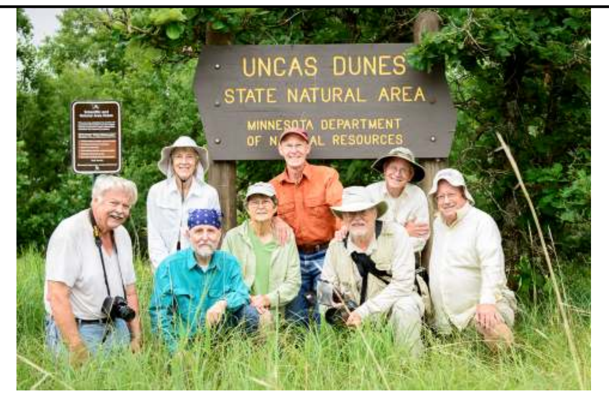
Several members of the Breckenridge Chapter recently joined others from the Friends of Minnesota Scientific and Natural Areas to explore the Uncas Dunes SNA and view the abutting Sand Dunes State Forest (SDSF).