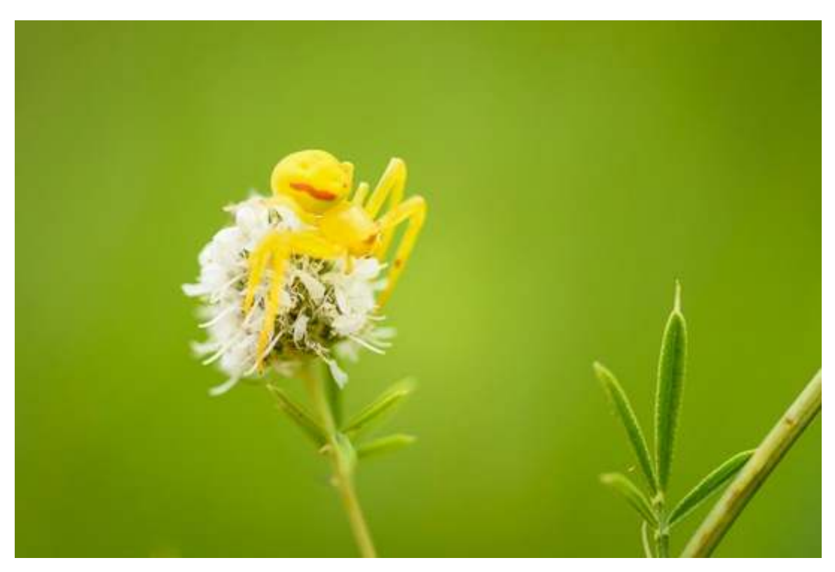
Goldenrod crab spider on white prairie clover