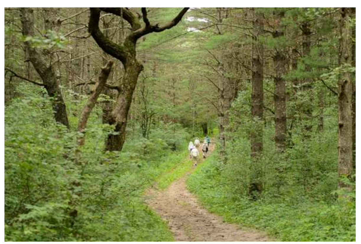
Members hiking though pine plantation in the SDSF